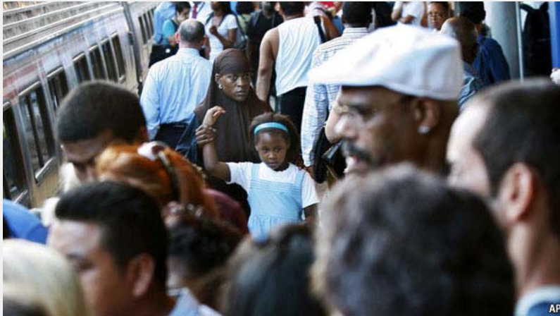
The Amtrak alternative

Air travel is no relief. Airport delays at hubs like Chicago and Atlanta are as bad as any in Europe. Air travel still relies on a ground-based tracking system from the 1950s, which forces planes to use inefficient routes in order to stay in contact with controllers. The system's imprecision obliges controllers to keep more distance between air traffic, reducing the number of planes that can fly in the available space. And this is not the system's only bottleneck. Overbooked airports frequently lead to runway congestion, forcing travellers to spend long hours stranded on the tarmac while they wait to take off or disembark. Meanwhile, security and immigration procedures in American airports drive travellers to the brink of rebellion.