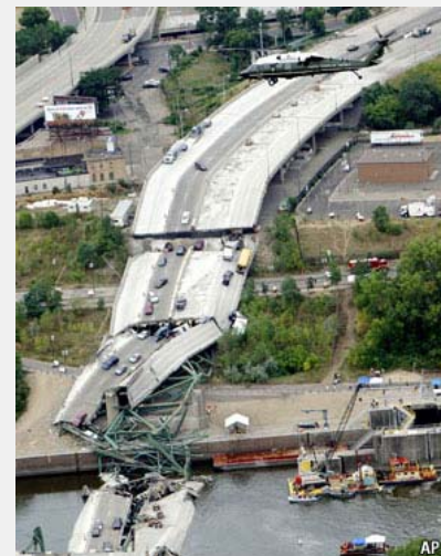
Please, not again