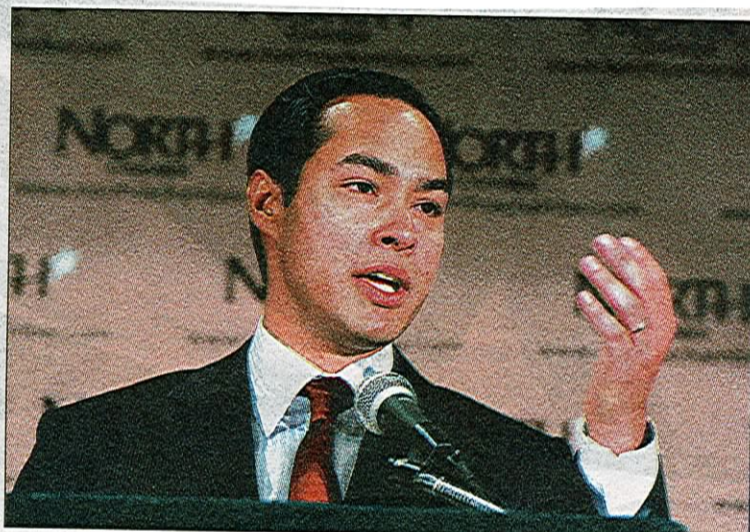
Mayor Julián Castro says he wants to leverage $30 million in 2012 bond money to build the connector ramps on the north side of the Loop 1604/U.S. 281 interchange. The project would cost about $60 million.